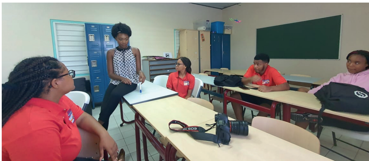
Participants #MyNewWorld, St. Eustatius

“I think participating in this project was a good experience because it happens too often that people forget about our (children’s) opinions. It’s like if you can’t vote you don’t have a say. But now we do have a say and I hope we keep having one.”