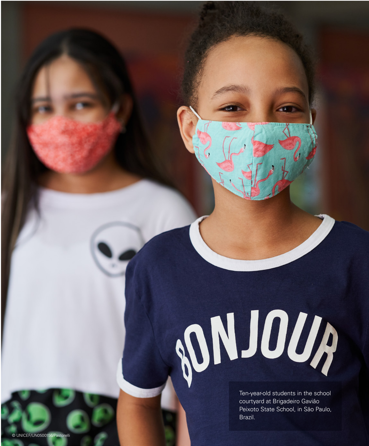
Ten-year-old students in the school courtyard at Brigadeiro Gavião Peixoto State School, in São Paulo, Brazil.