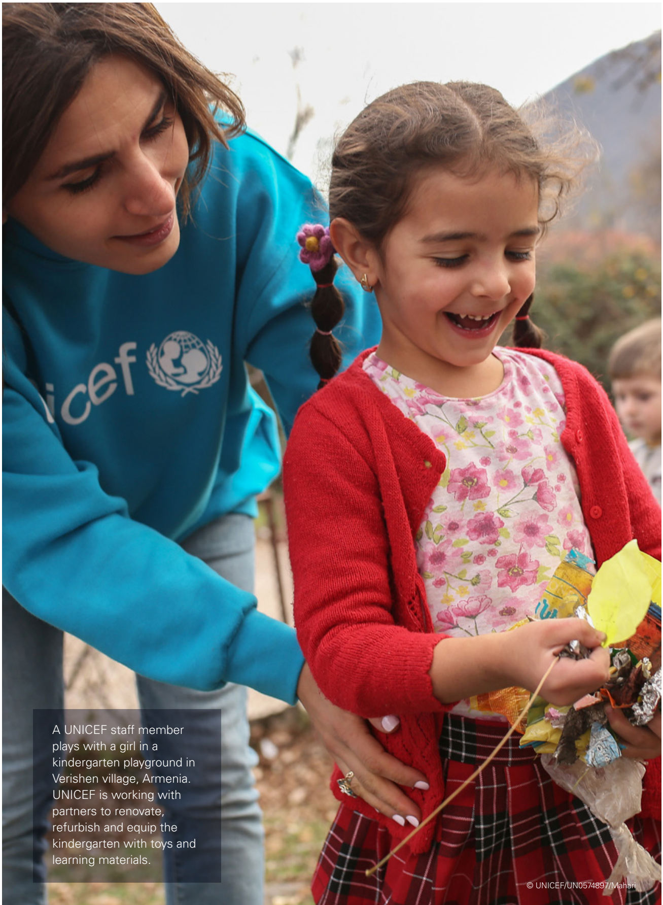
A UNICEF staff member plays with a girl in a kindergarten playground in Verishen village, Armenia. UNICEF is working with partners to renovate, refurbish and equip the kindergarten with toys and learning materials.